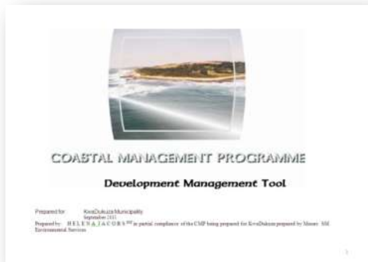
Figure 5. Completed KwaDukuza CMP Coastal Development Management Tool (Appendix C).

The process undertaken to achieve the study objectives in the development of the Coastal Development Management Tool (Appendix A) and were carried out jointly by SSI Environmental and Helena Jacobs PSF in three phases and were undertaken as follows: