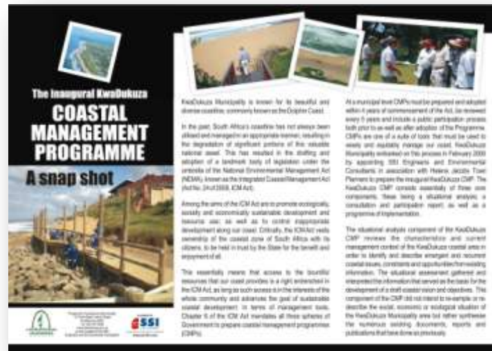
Figure 4. KwaDukuza CMP Z-fold Document (Appendix B).