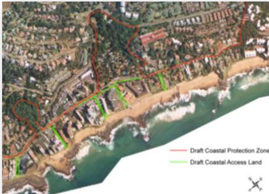
Figure 6. Draft Coastal Protection Zone and Draft Coastal Access Land at Precinct 2, Ballito (Appendix D).