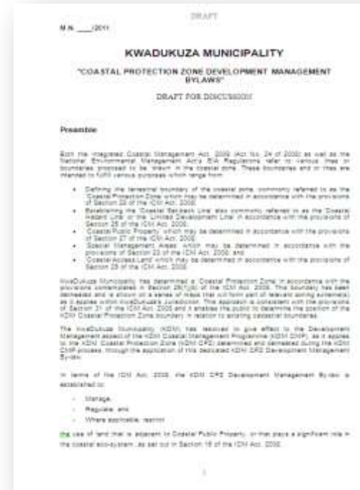
Figure 7. Draft Coastal Protection Zone Development Management By-Laws (Appendix E).